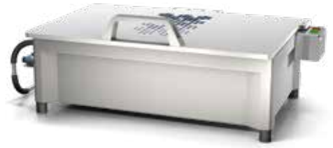
rigid test chamber

Efficient testing: For increased efficiency several cells may be tested simultaneously to achieve high throughput and productivity.